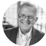
Bob Wright Legal